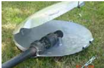
Open showing Valve