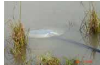
Working in Shallow Water